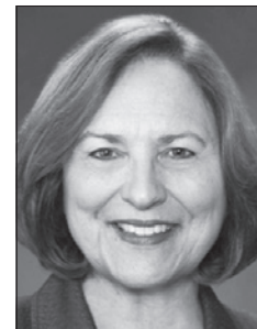
U.S. Senator Deb Fischer

This is why supporting federal law enforcement is essential. Their work directly contributes to the safety and security that Nebraskans rely on.