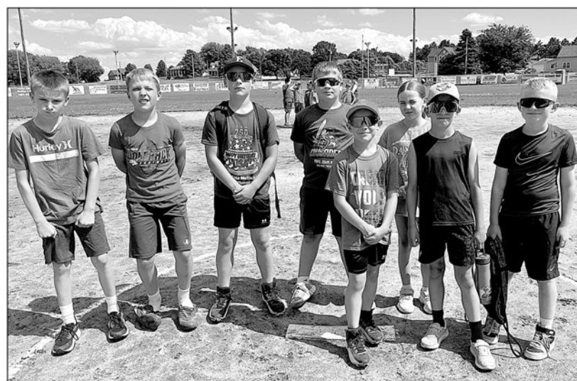
Ball Busters (E)