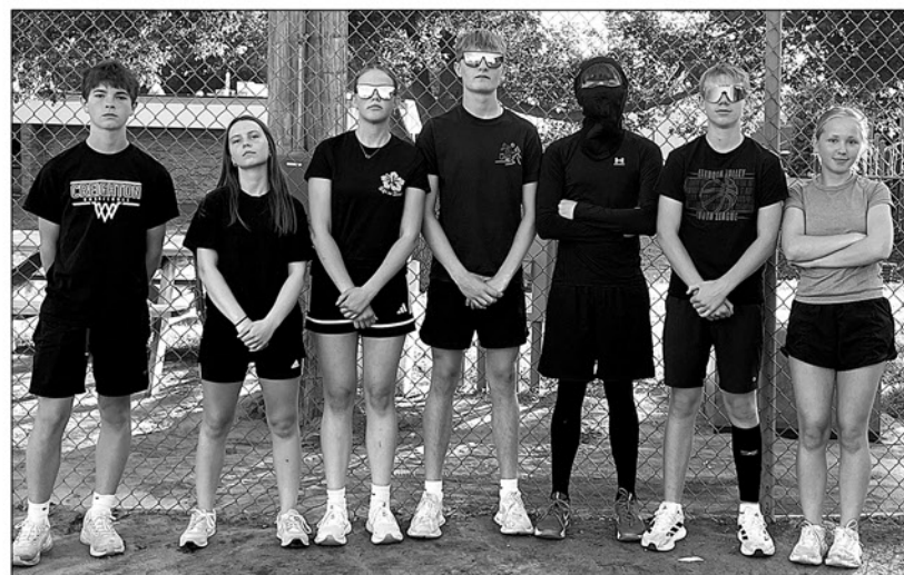
Ball Busters (JH/H)