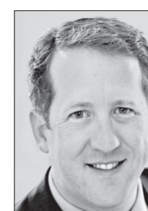
Congressman Adrian Smith