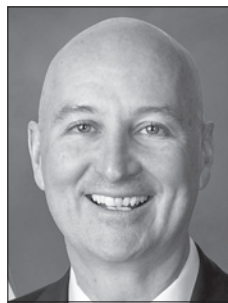
U.S. Senator Pete Ricketts

No one should feel lonely. Every Nebraskan and American should feel supported. When I was Governor, we worked to strengthen mental health care in Nebraska. As a result of these efforts, U.S. News and World Report ranked Nebraska as having the fourth-best mental health in the nation.