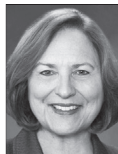
U.S. Senator Deb Fischer