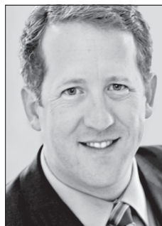
Congressman Adrian Smith

After years of unnecessary roadblocks, I am proud to say the House recently passed my Nationwide Consumer and Fuel Retailer Choice Act on a bipartisan basis. This marks a major victory for Nebraska agriculture, American energy independence, and consumers across the country.